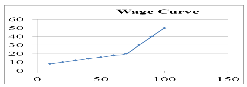
Figure 3 Wage Curve

(IJTBM) 2020, Vol. No.10, Issue No. I, Jan-Mar