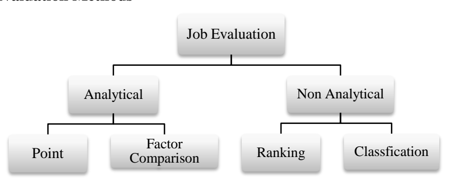
Figure 2 Job Evaluation Methods